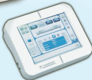
OPTIONAL TOUCH SCREEN CONTROL CONSOLE