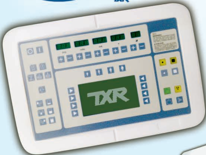
STANDARD CONTROL CONSOLE

COST EFFECTIVE HF GENERATORS WITH NO COMPROMISE IN QUALITY. A Generator To Fit Every Need!