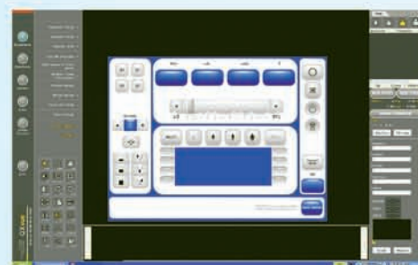
GENERATOR INTEGRATION, CCD